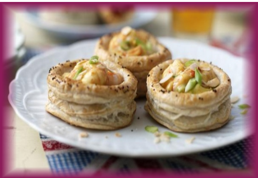
15225 - Cocktail Vol au Vents