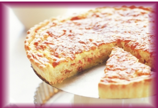
23022 - Classic Lorraine