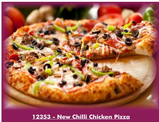
12353 - New Chilli Chicken Pizza