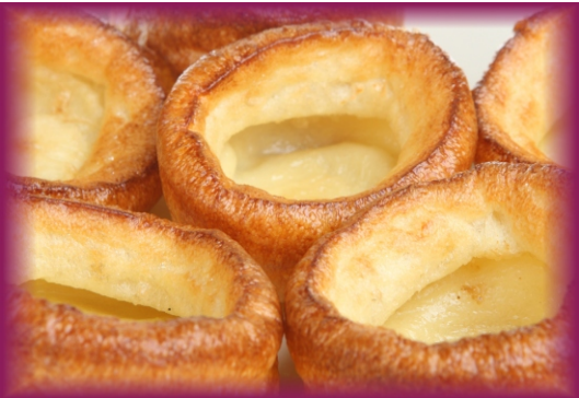
33 - Yorkshire Pudding Fully Baked 3"