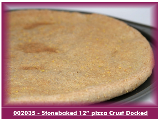
002035 - Stonebaked 12" pizza Crust Docked