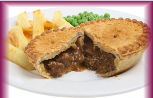
75051 - New Pukka Microwave Steak Pies