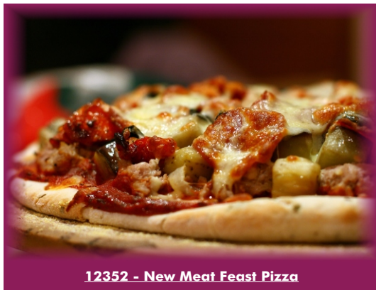
12352 - New Meat Feast Pizza