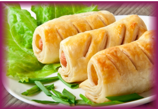
NF2 - Uncooked Sausage Rolls 3.5"