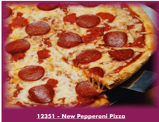
12351 - New Pepperoni Pizza